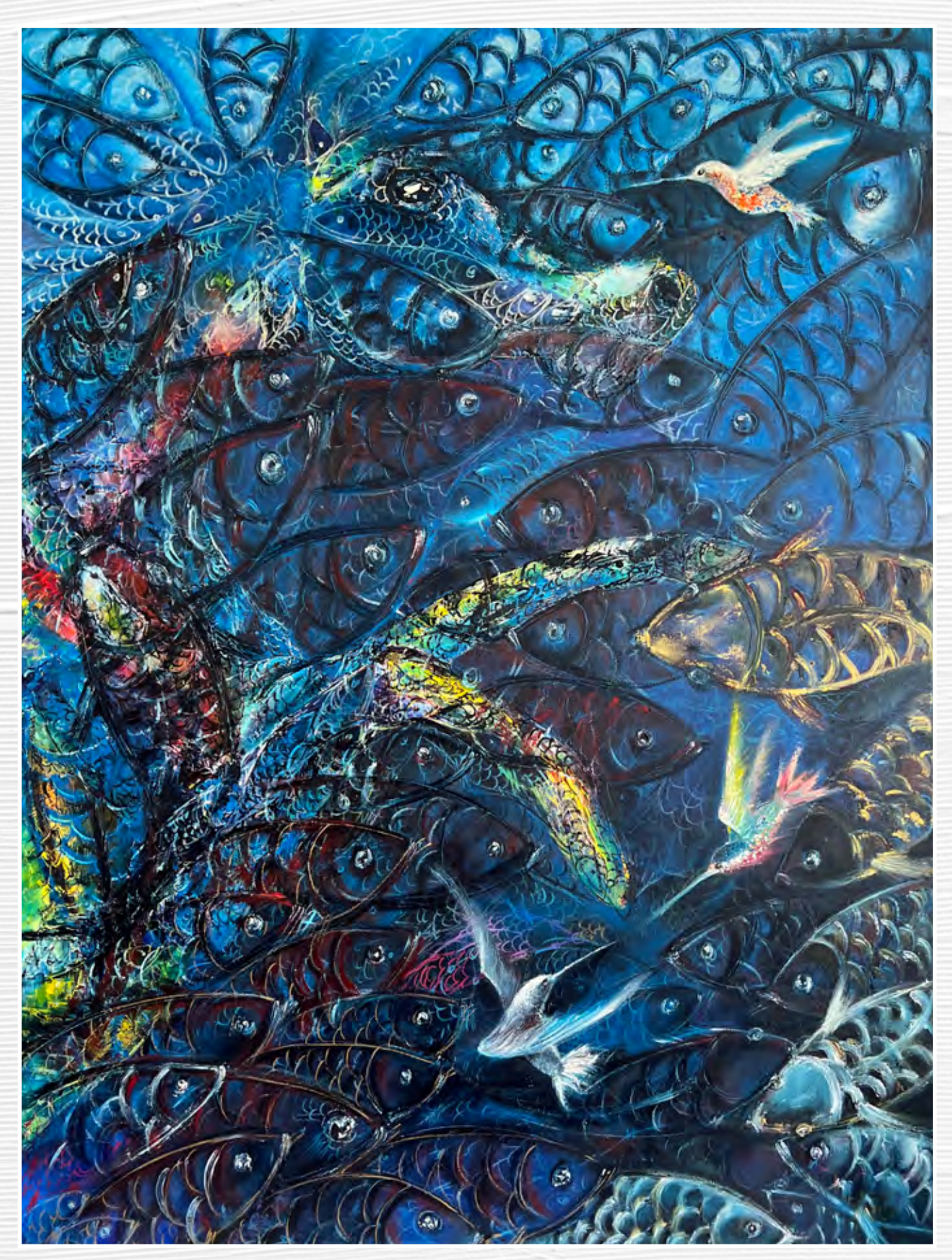
Eternity, Oil on Canvas, 30x40 inches