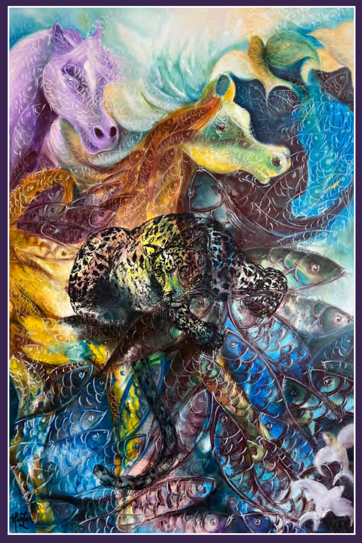
Pantera Camelon, Oil on Canvas, 24x36 inches