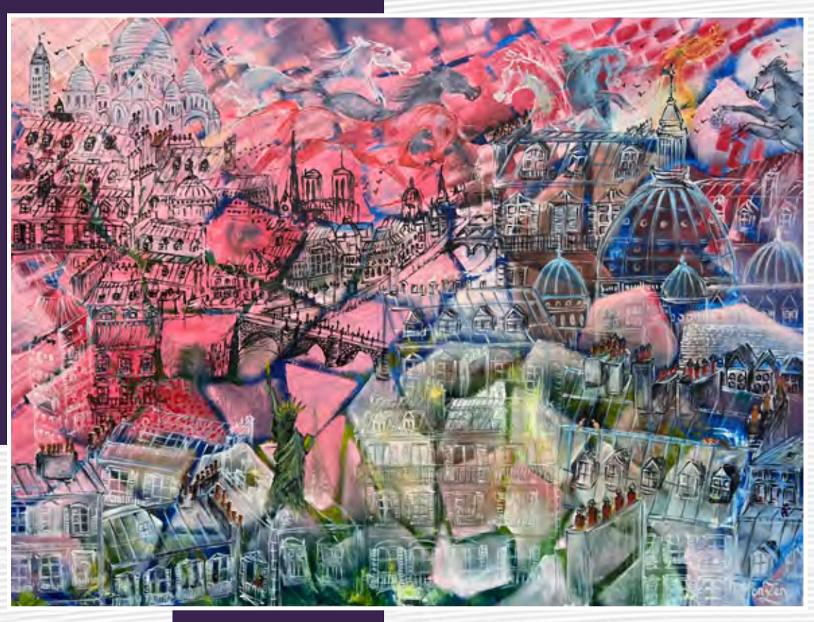
Rose Hour - ForEver PARIS, Oil on Canvas, 40x30 inches