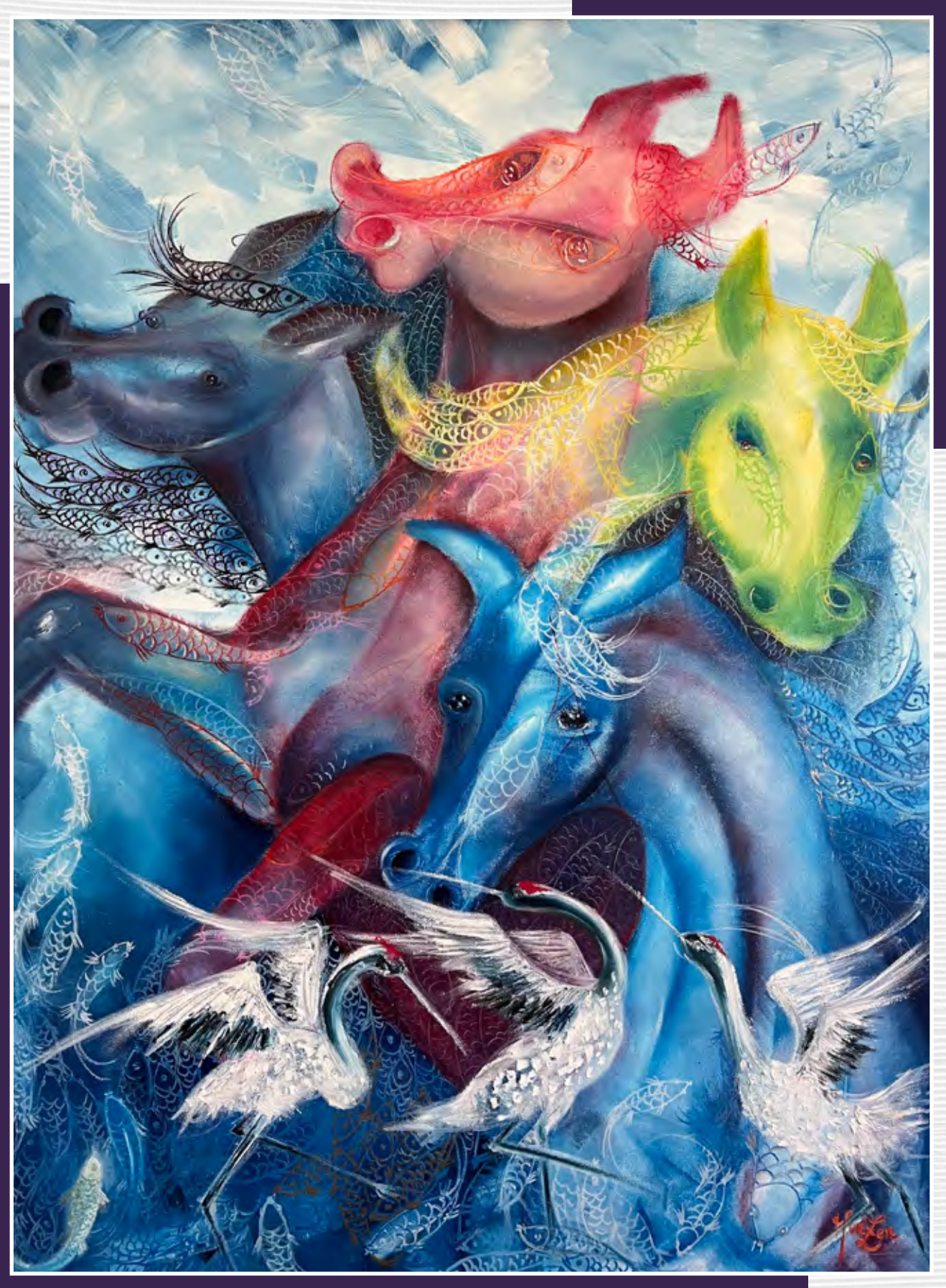
Ocean of Love, Oil on Canvas, 30x40 inches "Best in Show" at the juried March 2024 Art League Exhibition, at the Torpedo Art Factory Center, Washington Metropolitan Area, USA