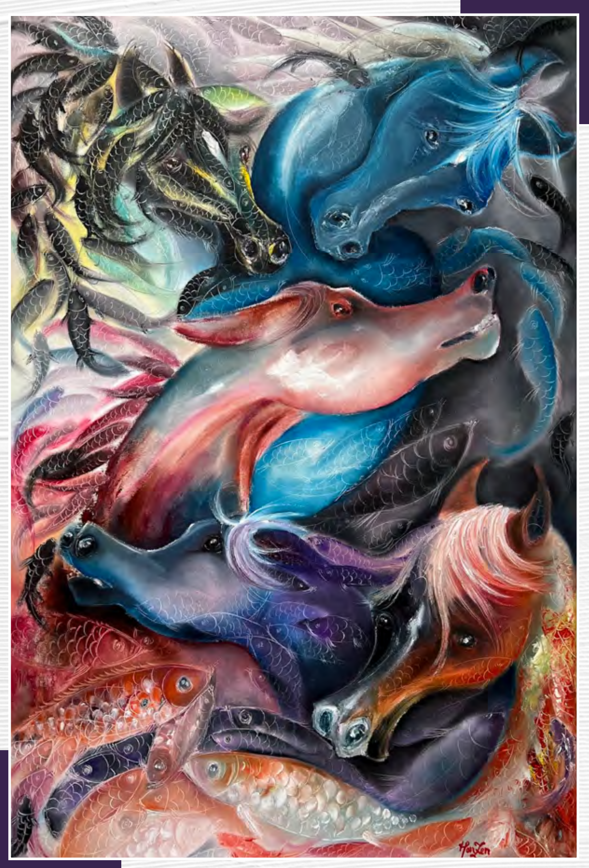
Color of Life, Oil on Canvas, 24x36 inches