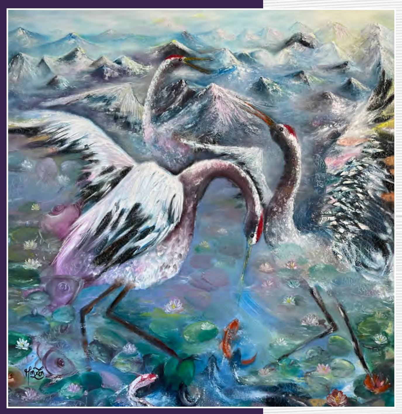
The treasure of Monet's Garden, Oil on Canvas, 36x36 inches